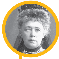
Berta von Suttner Frieden