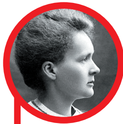
Marie Curie Chemie