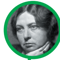
Sigrid Undset Literatur