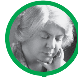
Grazia Deledda Literatur