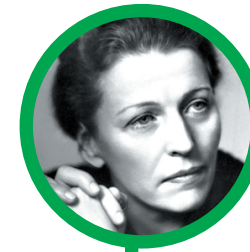
Pearl S. Buck Literatur