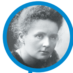
Marie Curie Chemie