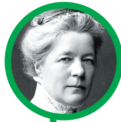
Selma Lagerlöf Literatur