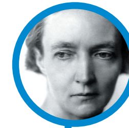
Irène Joliot-Curie Chemie